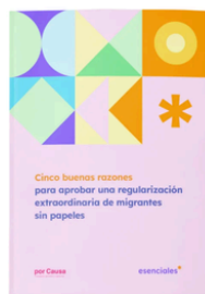
Cinco buenas razones para aprobar una regularización extraordinaria de migrantes sin papeles.