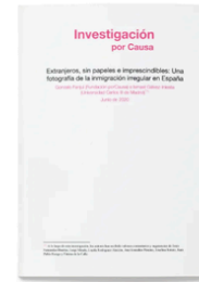
Foreign, essential and undocumented: A snapshot of irregular immigration in Spain