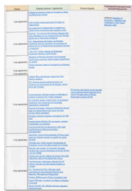
Calendario europeo y español sobre migraciones y asilo 2021-2022