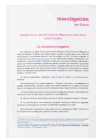
Balance de un año del Pacto de Migración y Asilo de la Unión Europea.