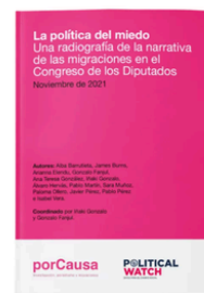
La política del miedo. Una radiografía de la narrativa de las migraciones en el Congreso de los Diputados.