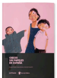
Crecer sin papeles en España.