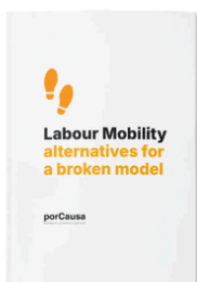
Alternatives to Labour Mobility Report

We welcome conversations with individual philanthropists, family foundations, and impact-driven funders who want their support to translate into measurable policy change – not just reports on a shelf.