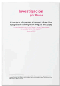
Extranjeros, sin papeles e imprescindibles: Una fotografía de la inmigración irregular en España.