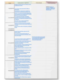
European and Spanish calendar on migration and asylum 2021-2022