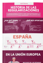
Melilla and the border exceptionality